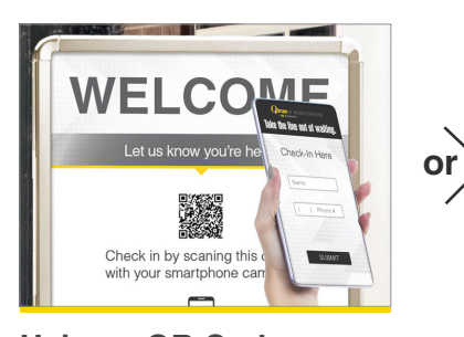
Using a QR Code Customers scan a QR code using their smartphone camera. This directs them to a webpage for self-check-in.