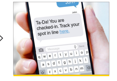
Using SMS messaging Using their smartphone, customers send a text. then receive a message with a link to the self-check-in webpage.